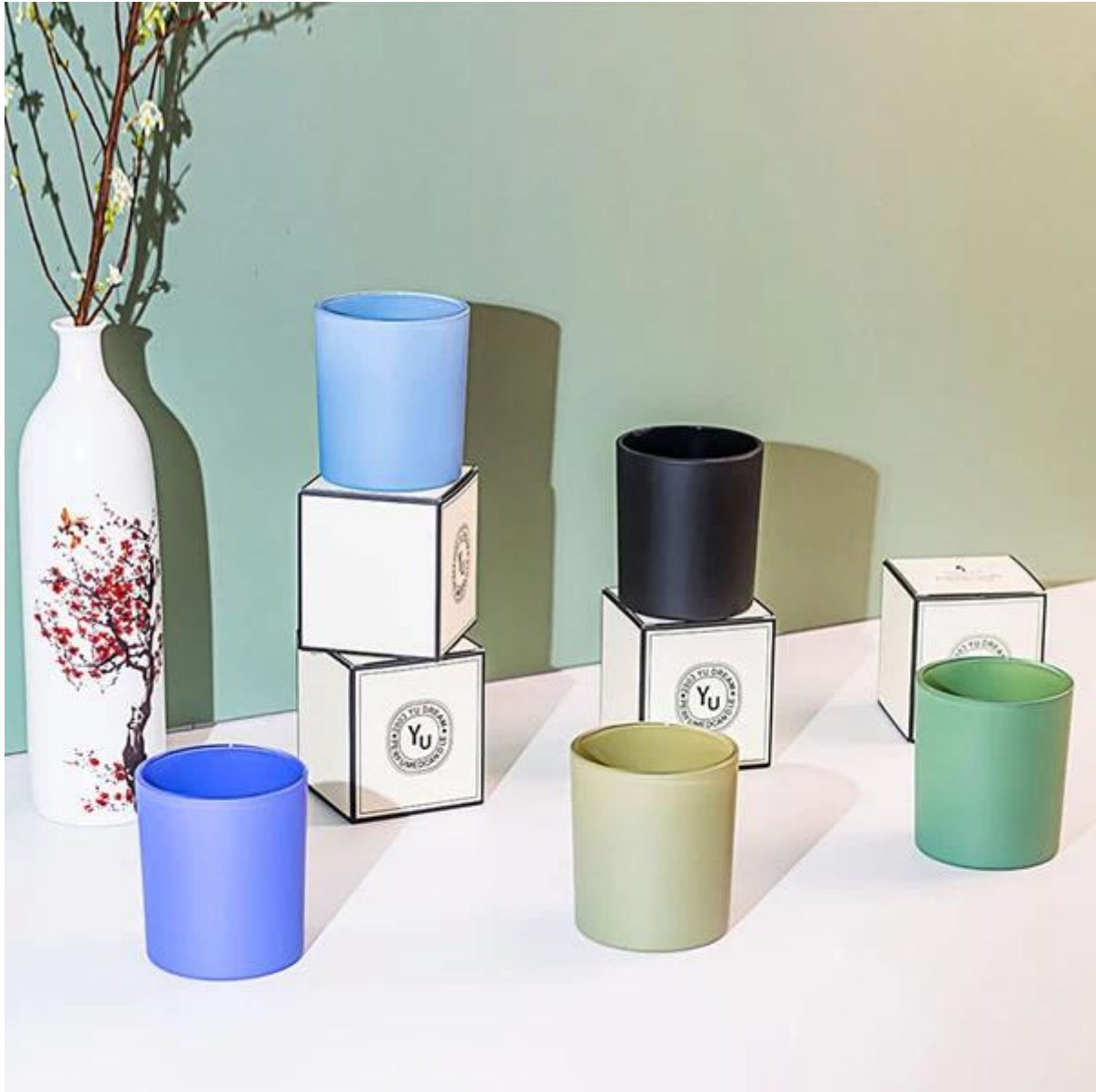
Cupwind factory painted candle jar has 8oz wax filling capacity, perfect size for votive holders. It's also a great home decor product in our house.