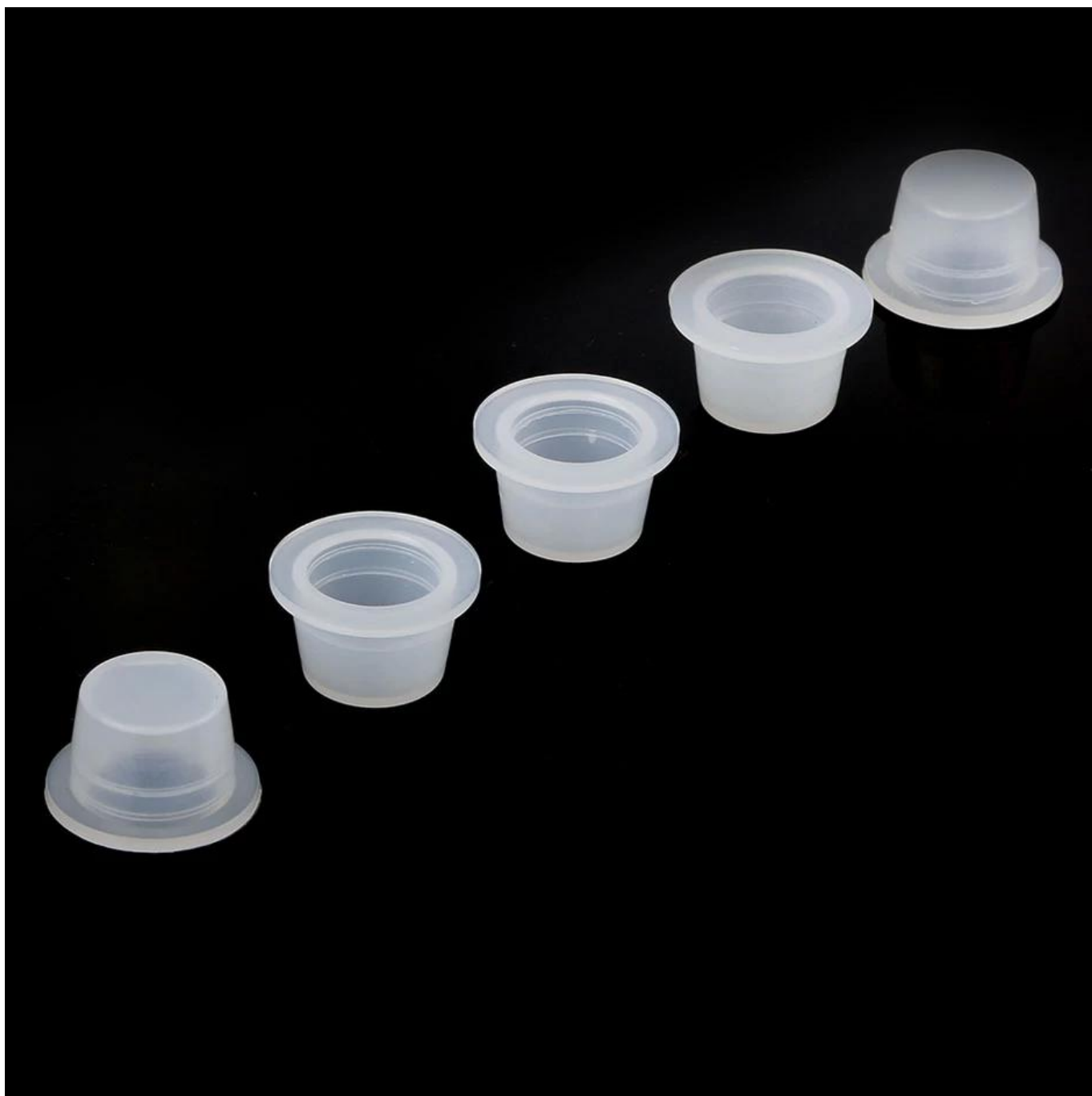
Stopper for diffuser bottle