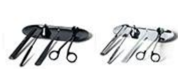
Wick Trimmer Cutter