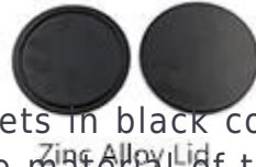
Zinc Alloy Lid