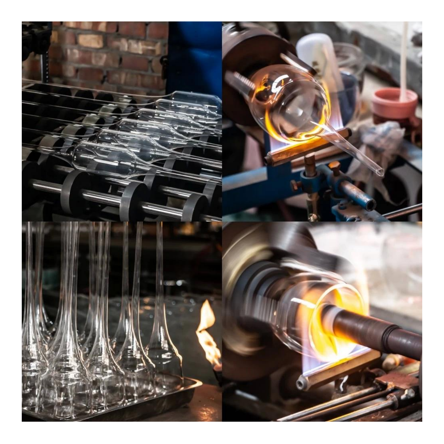
Packaging of Borosilicate Water Jug

We will find out suitable packaging method according to different size products, for the water jug, we will pack it in a brown inner box then 6boxes into a master carton.