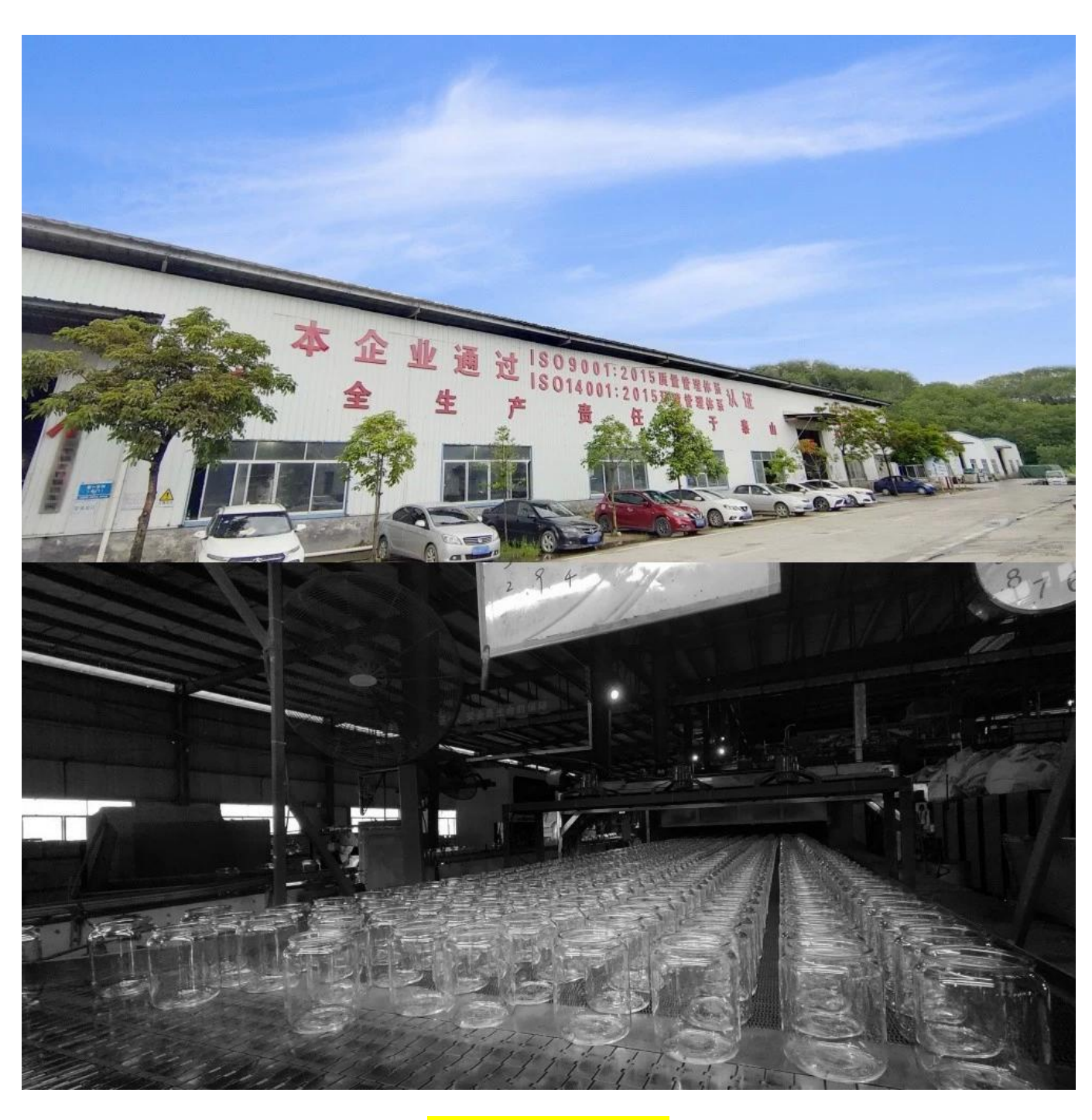
Cupwind office photo