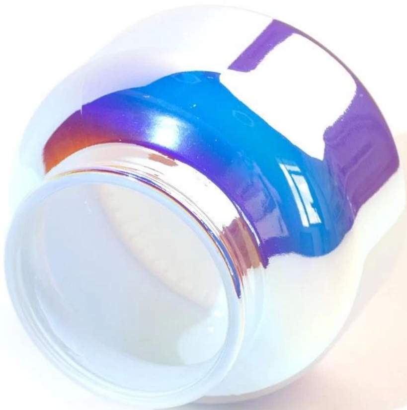
Packaging of Candle Holders