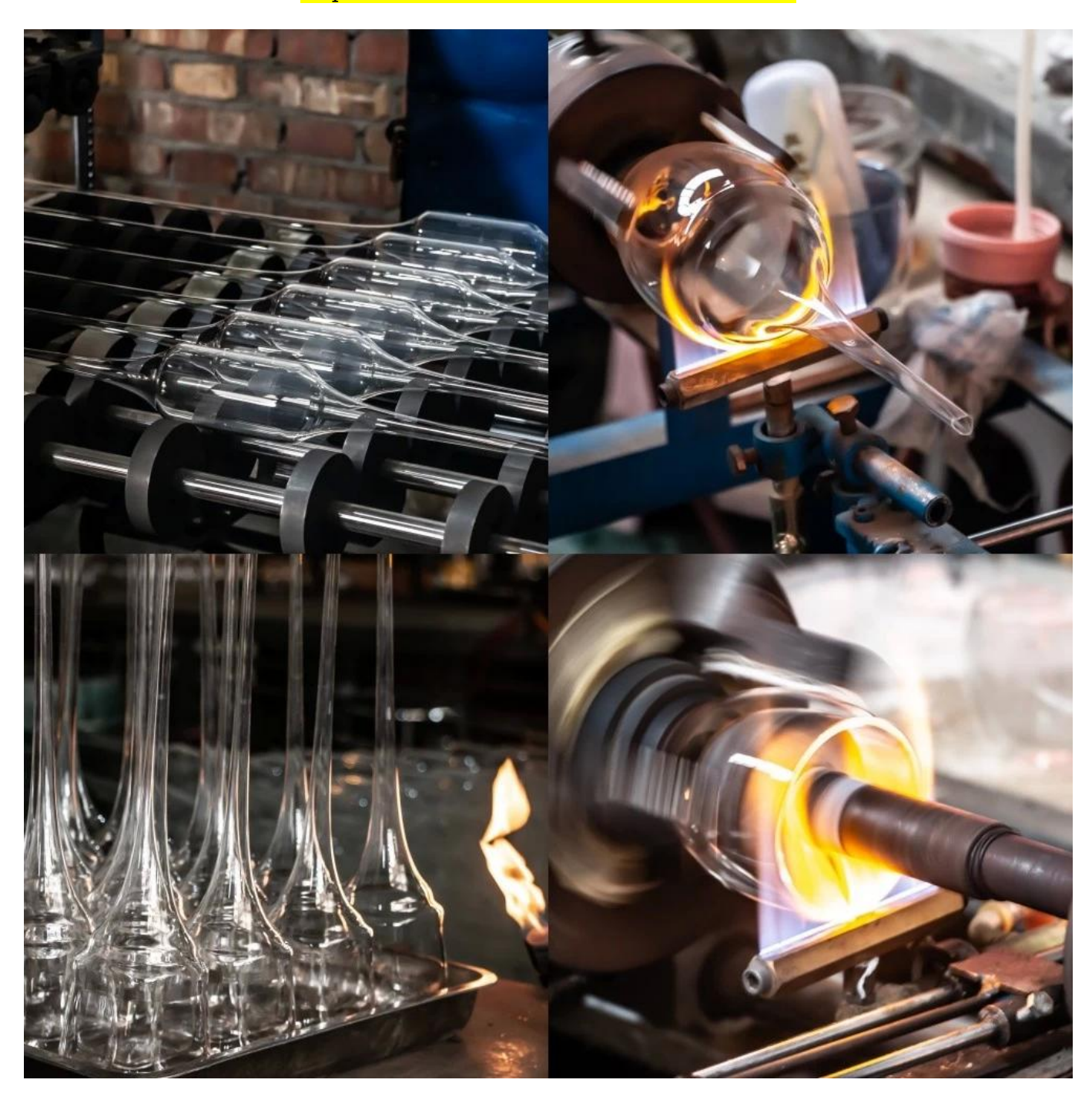
Cupwind Factory Photo