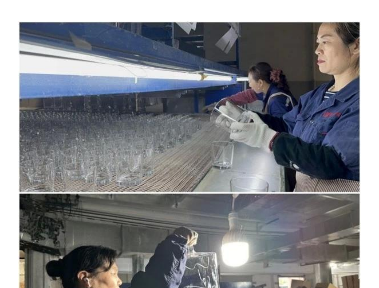
With 10+ years of experience serving global candle brands, we guarantee: