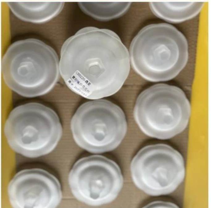
Cupwind Factory Photo