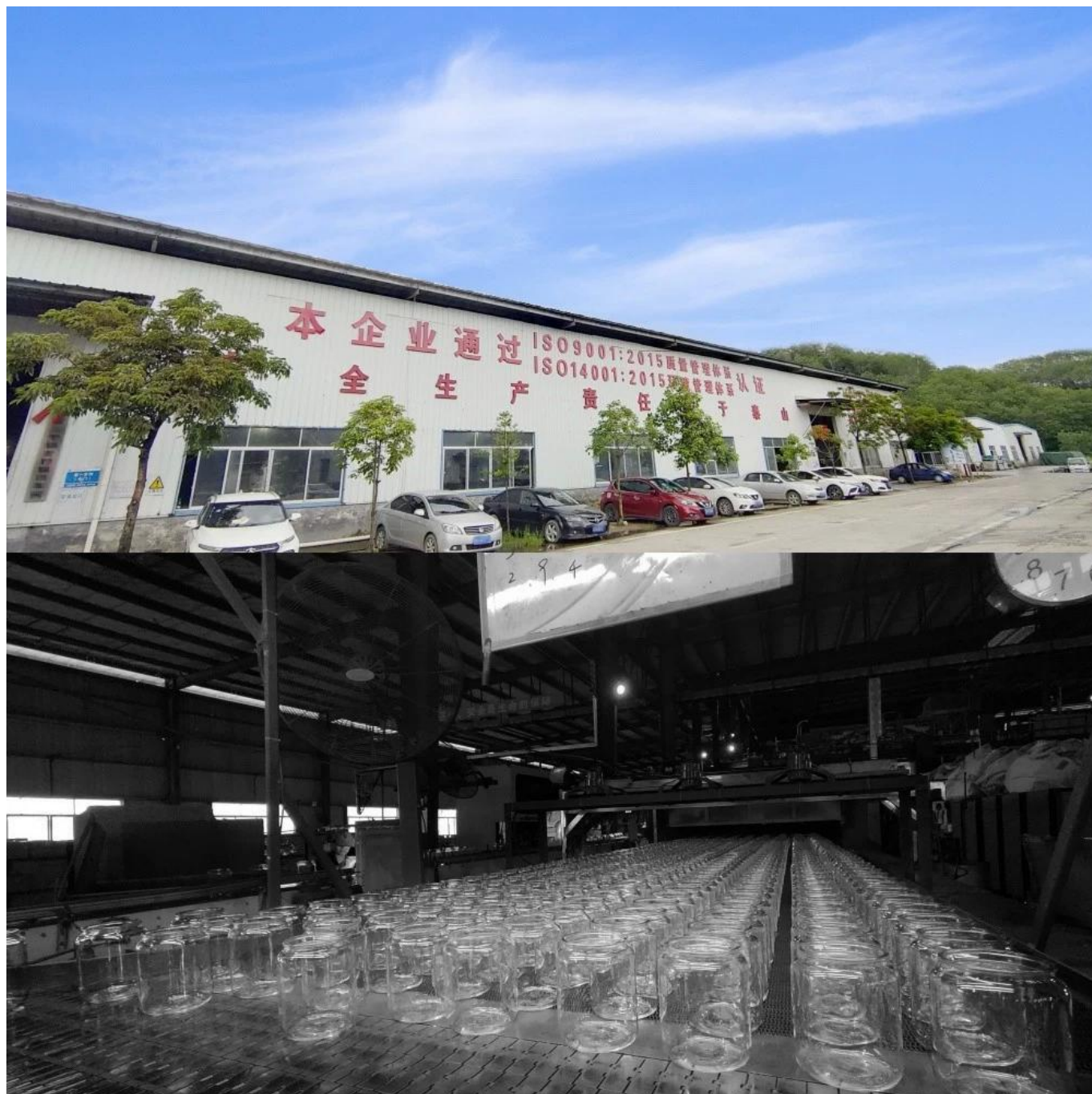
Cupwind office photo