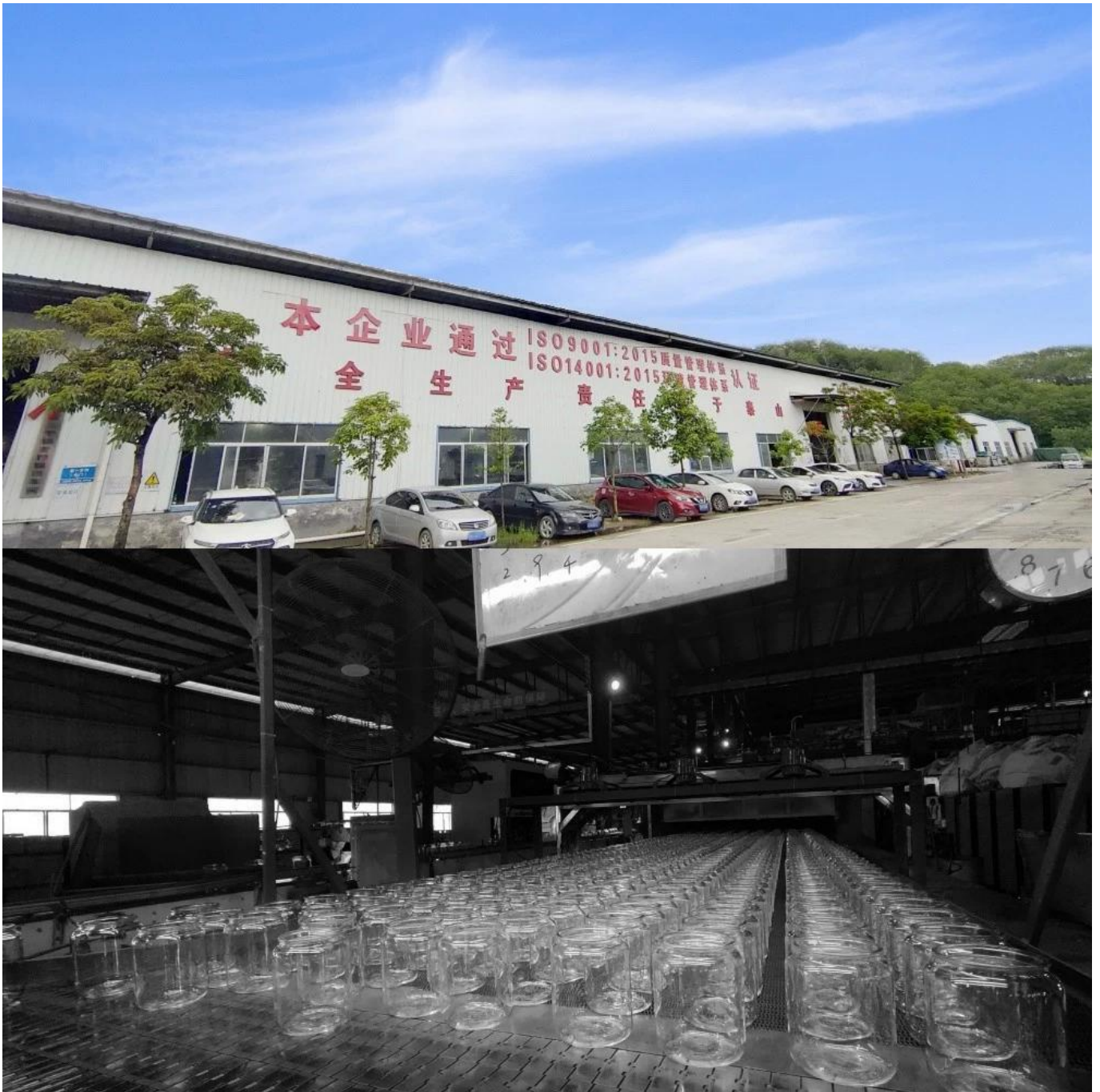
Cupwind office photo