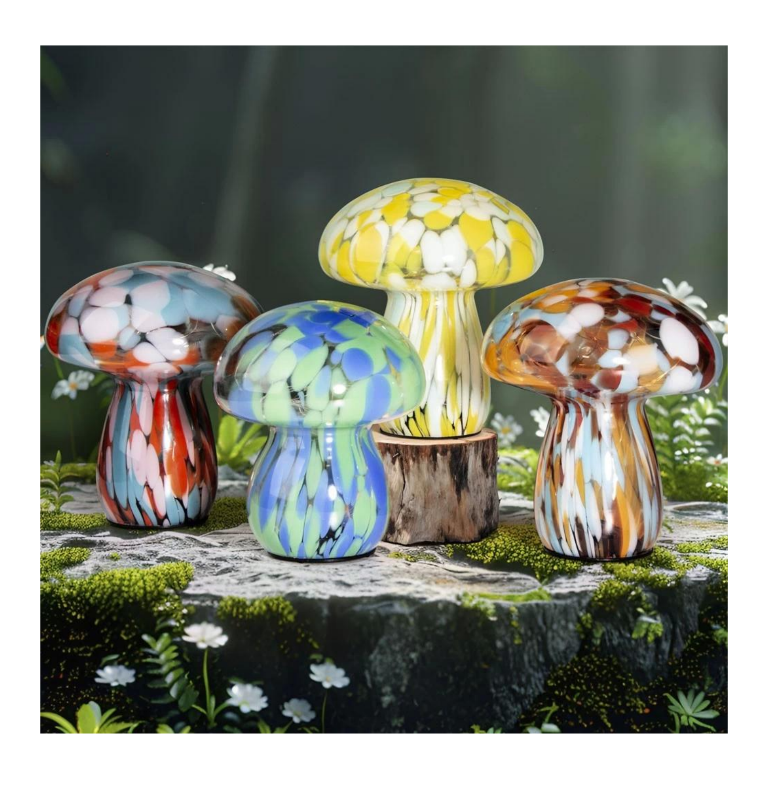
Cupwind Factory Photo