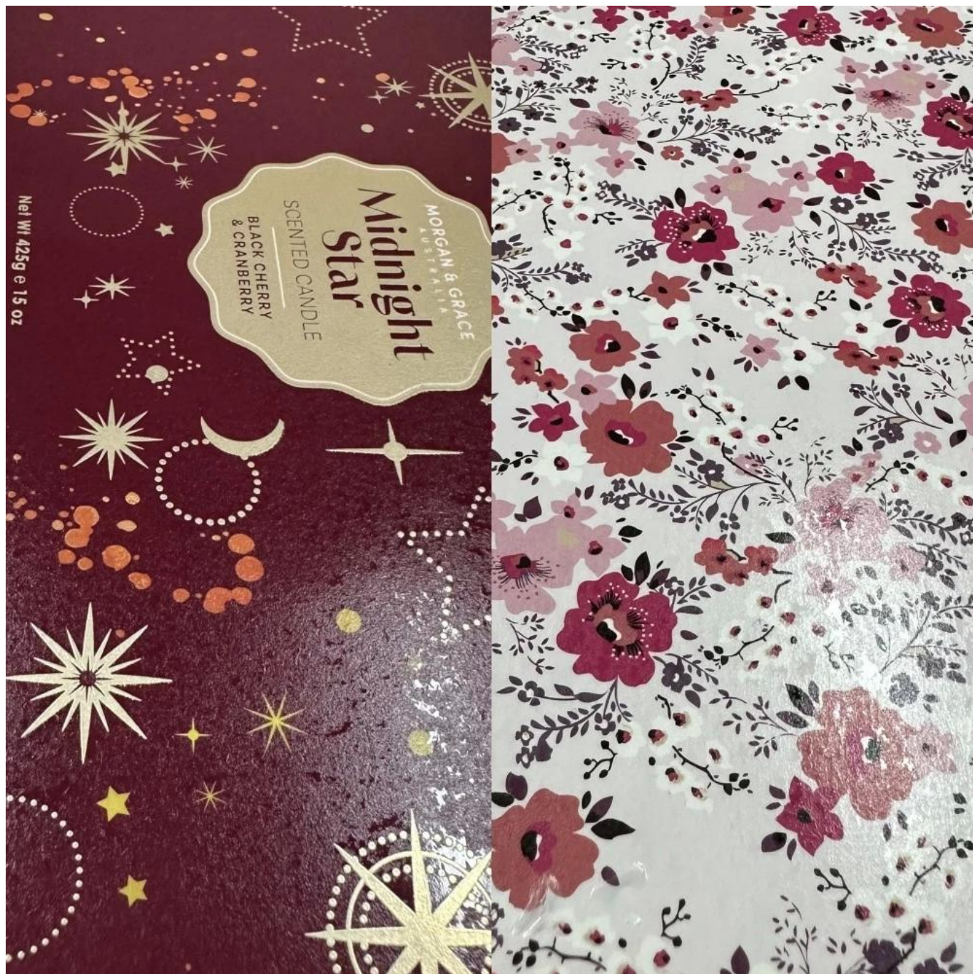
Cupwind Factory Photo