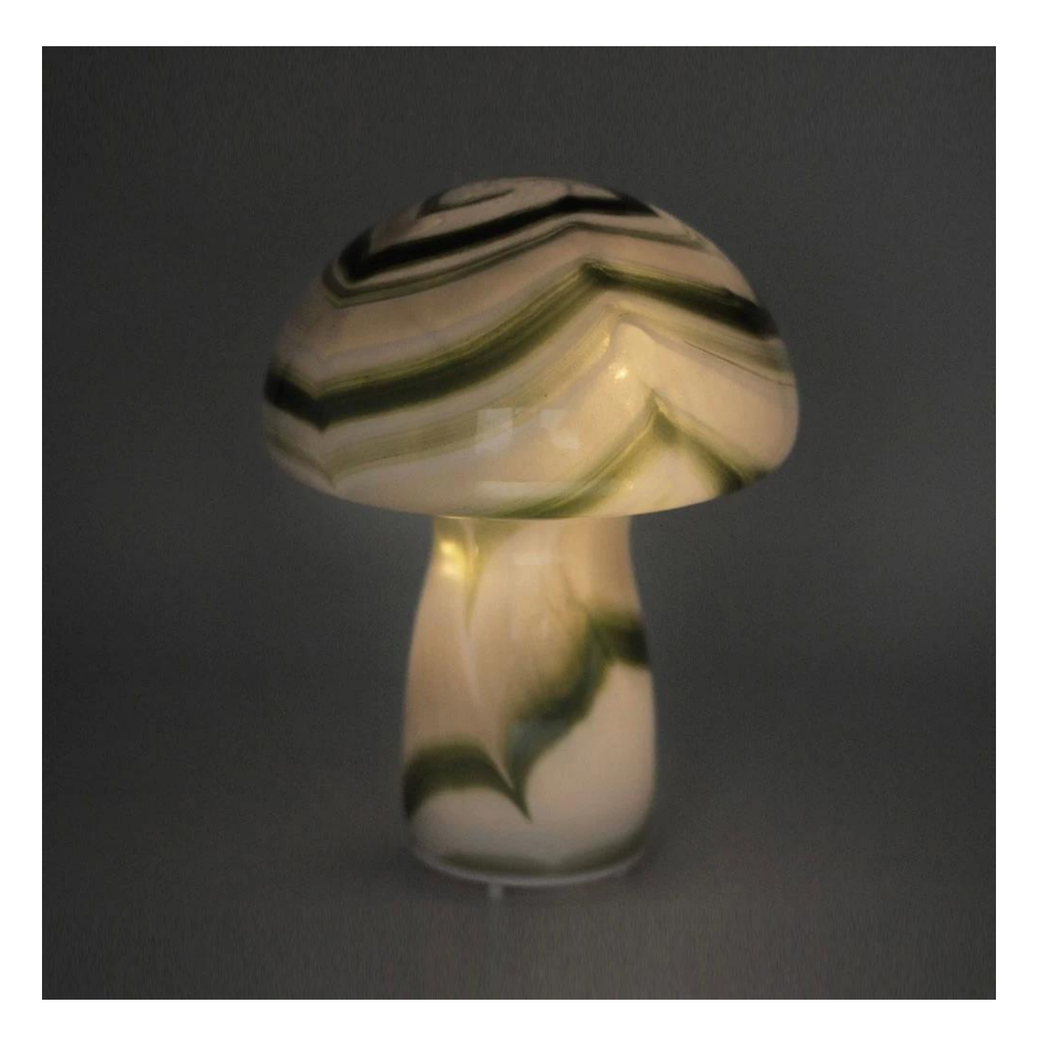
Benefits for Your Business Attractive Retail Product: With their whimsical design and high-quality craftsmanship, our Handmade Glass Lamps make an enticing addition to any retail collection, appealing to

Energy Efficient: Each lamp comes equipped with an energy-efficient LED bulb, promoting sustainability while reducing electricity costs for end-users.