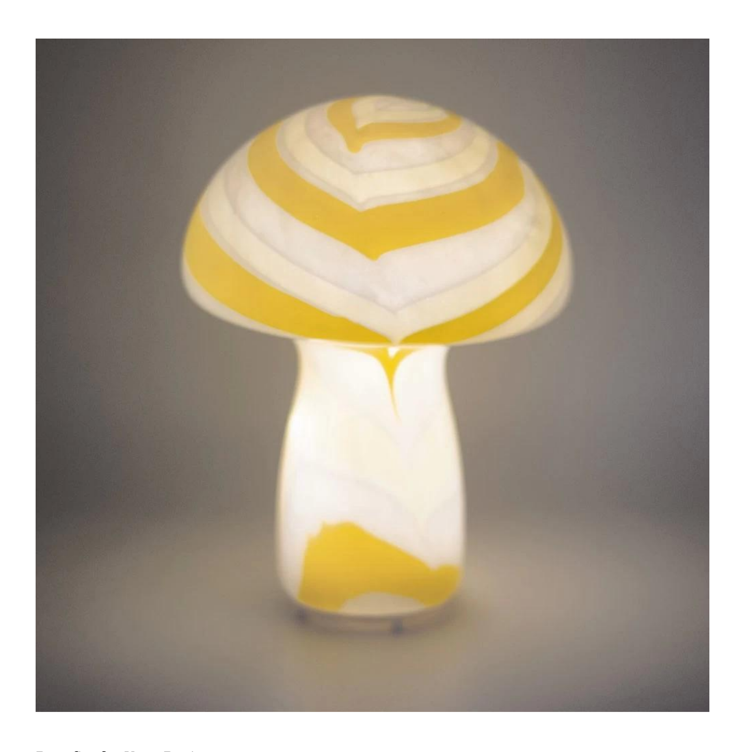
Benefits for Your Business Attractive Retail Product: With their whimsical design and high-quality craftsmanship, our Handmade Glass Lamps make an enticing addition to any retail collection, appealing to

Energy Efficient: Each lamp comes equipped with an energy-efficient LED bulb, promoting sustainability while reducing electricity costs for end-users.