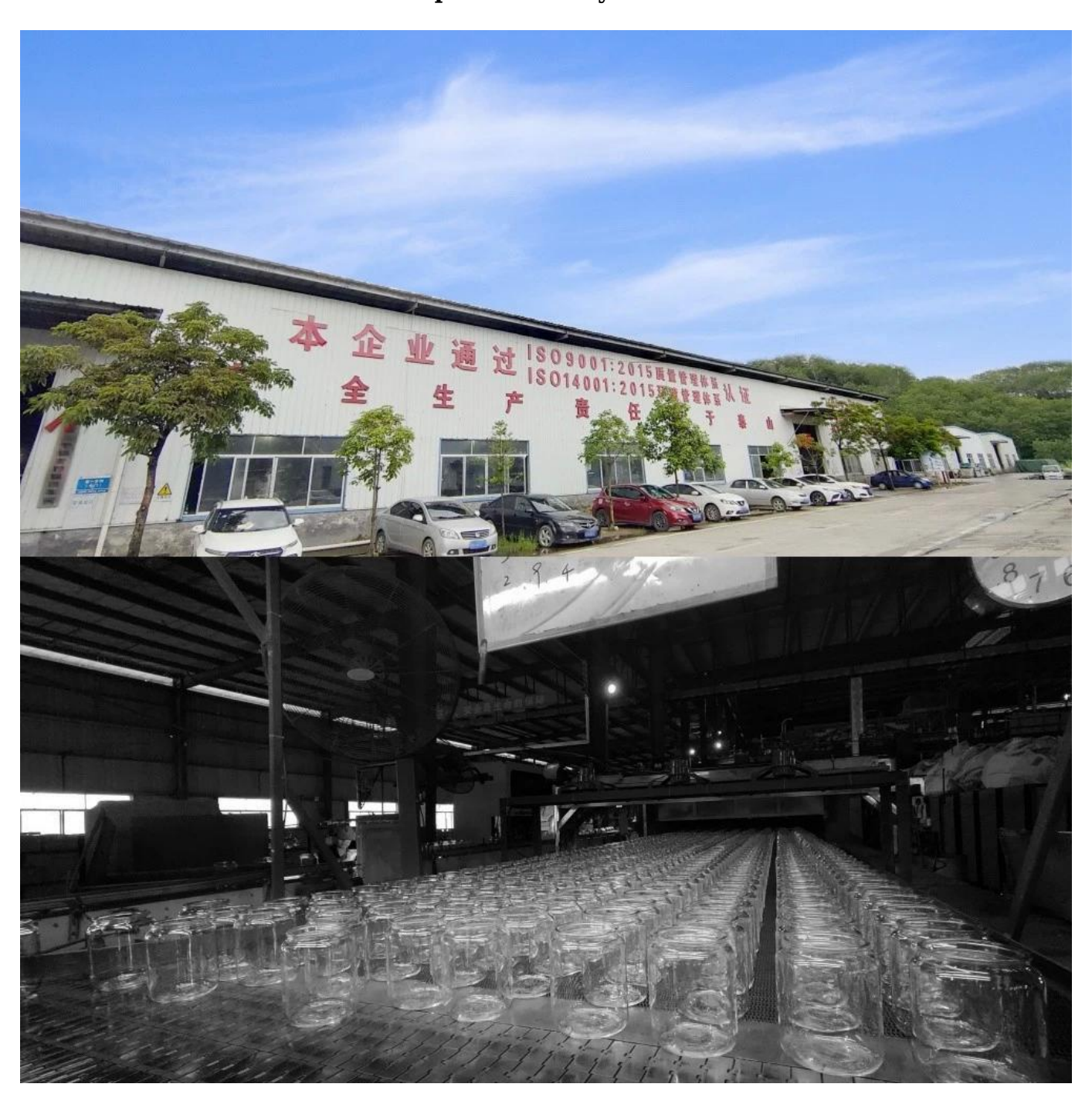
Cupwind office photo