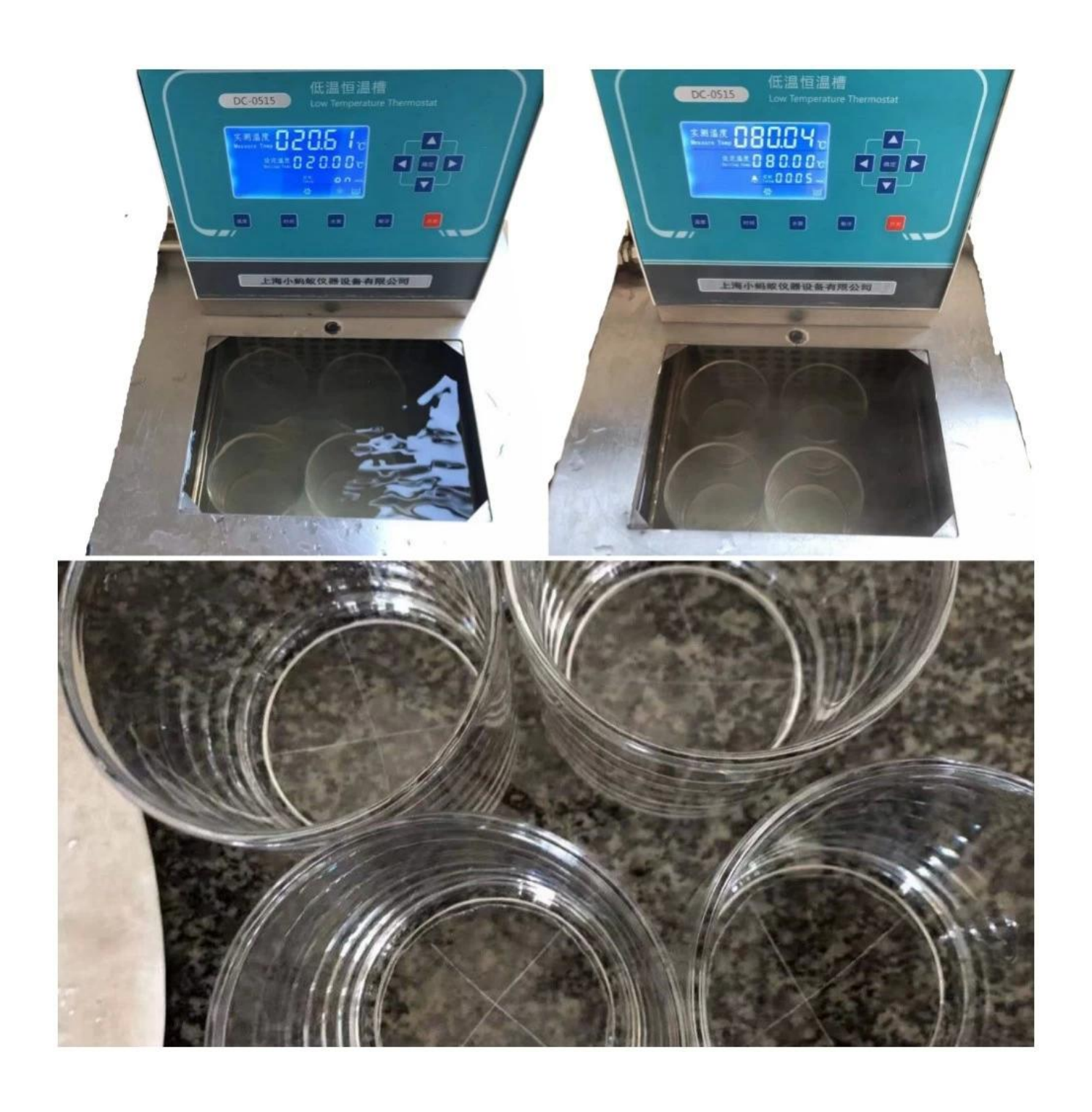
Cupwind Candle Jar Production Line