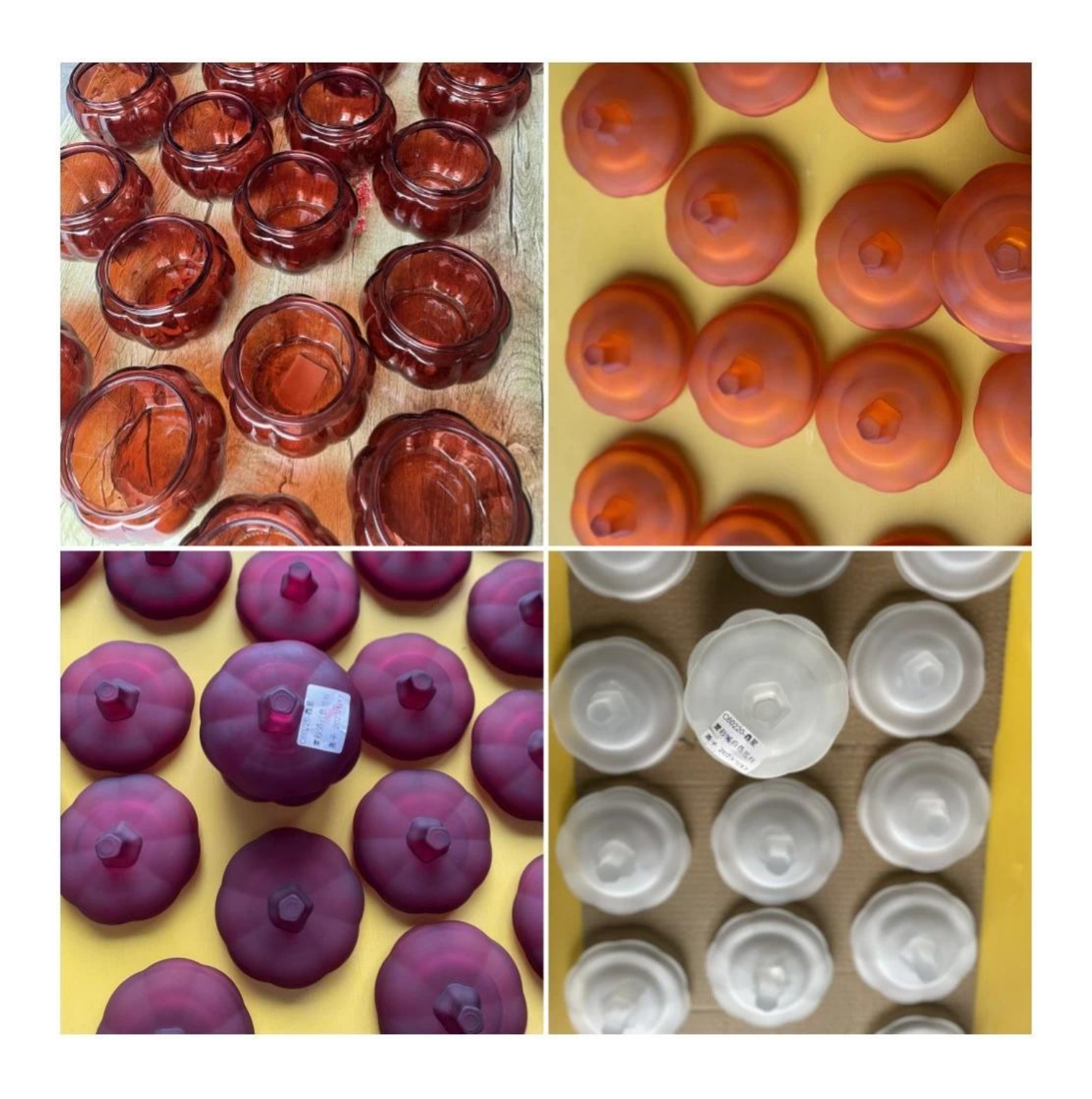
Cupwind Factory Photo