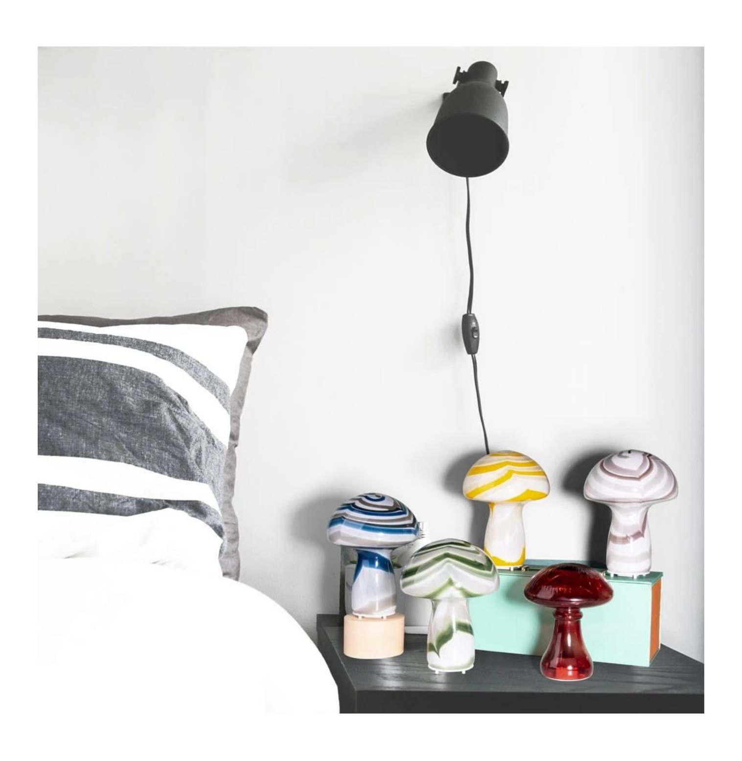
Cupwind Factory Photo