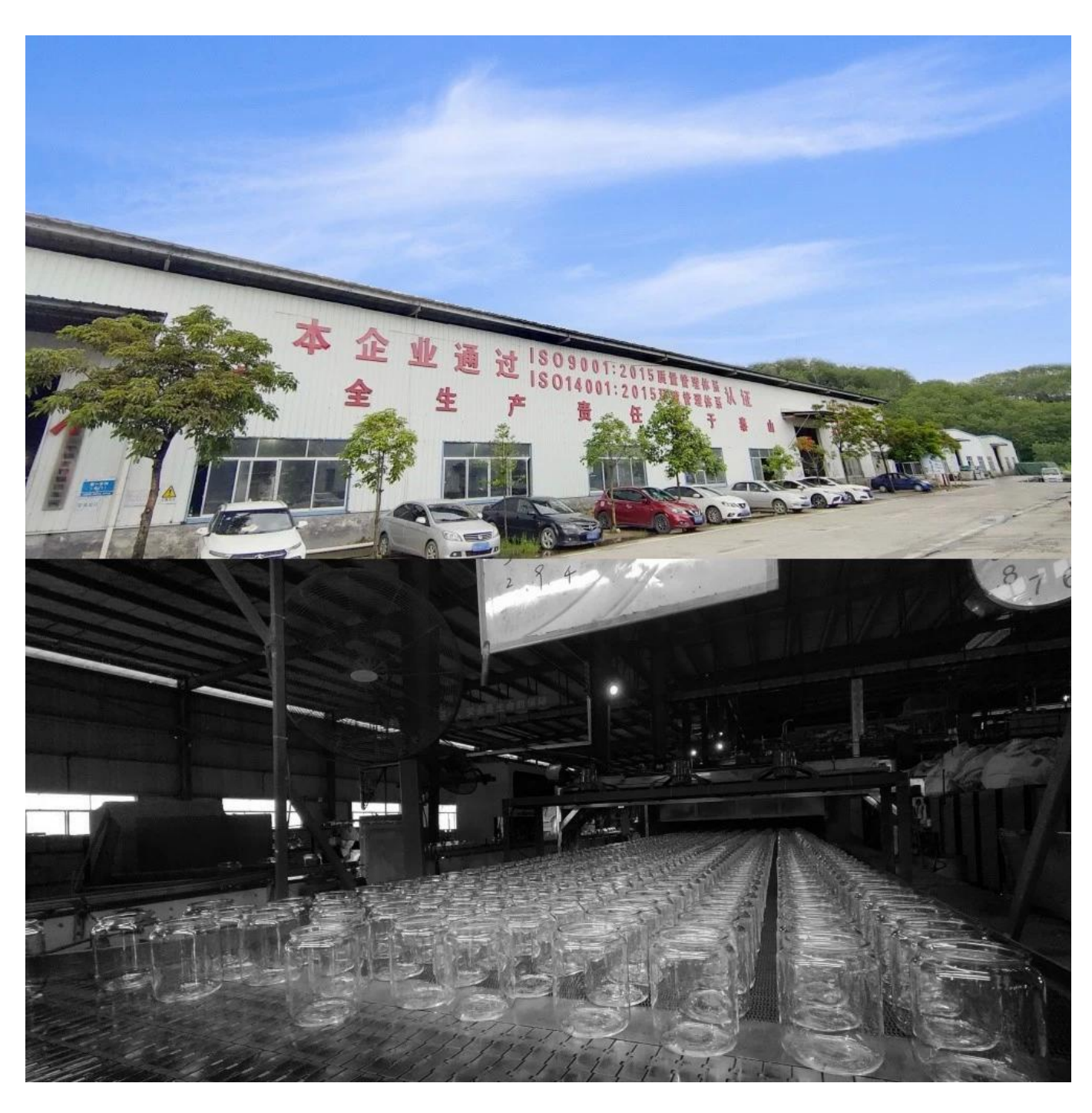
Cupwind office photo