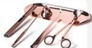
Wick Trimmer Cutter