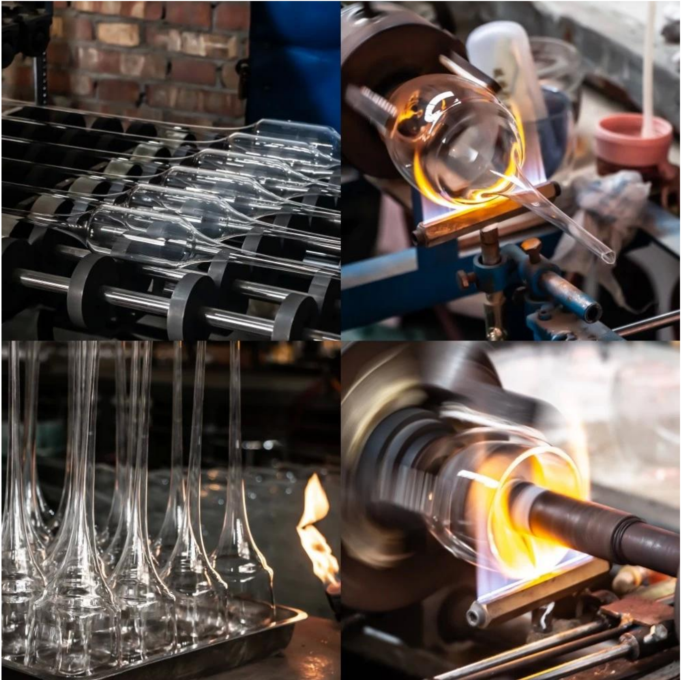
Cupwind Factory Photo