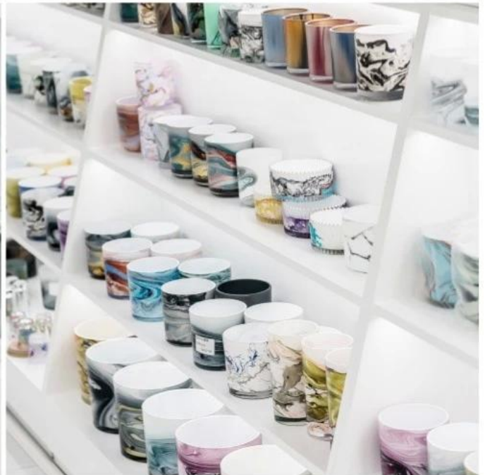
Cupwind Borosilicate Production Line